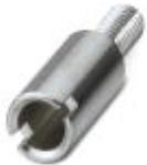
Female test connector, color: silver

Female test connector - PSB 3,5/8,5/6 - 0305297