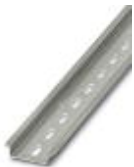
DIN rail perforated, Standard profile, width: 35 mm, height: 7.5 mm, acc. to EN 60715, material: Steel, galvanized, passivated with a thick layer, length: 2000 mm, color: silver

DIN rail perforated - NS 35/ 7,5 PERF 2000MM - 0801733