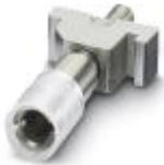
Female test connector, with slide, color: transparent

Female test connector - PSBJ-GSK/S FARBLOS - 0305394