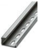
DIN rail perforated, G profile, width: 32 mm, height: 15 mm, acc. to EN 60715, material: Steel, galvanized, passivated with a thick layer, length: 2000 mm, color: silver

DIN rail perforated - NS 32 PERF 2000MM - 1201002