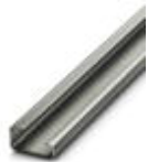
DIN rail, unperforated, G profile, width: 32 mm, height: 15 mm, acc. to EN 60715, material: Steel, galvanized, passivated with a thick layer, length: 2000 mm, color: silver

DIN rail, unperforated - NS 32 UNPERF 2000MM - 1201015