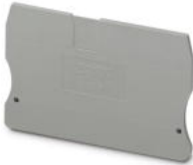
End cover, length: 71.5 mm, width: 2.2 mm, height: 49.9 mm, color: gray

Please be informed that the data shown in this PDF Document is generated from our Online Catalog. Please find the complete data in the user's documentation. Our General Terms of Use for Downloads are valid ( http://phoenixcontact.com/download )