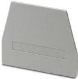
End cover, length: 61 mm, width: 2.2 mm, height: 48.5 mm, color: gray

Please be informed that the data shown in this PDF Document is generated from our Online Catalog. Please find the complete data in the user's documentation. Our General Terms of Use for Downloads are valid ( http://phoenixcontact.com/download )