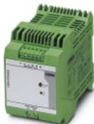
Primary-switched MINI POWER power supply for DIN rail mounting, input: 1-phase, output: 24 V DC/4 A

Please be informed that the data shown in this PDF Document is generated from our Online Catalog. Please find the complete data in the user's documentation. Our General Terms of Use for Downloads are valid ( http://phoenixcontact.com/download )