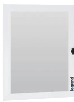
3 372 74