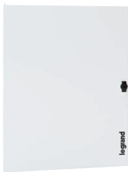
3 372 54