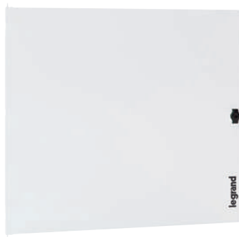
3 372 64