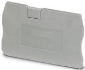
End cover, length: 48.6 mm, width: 2.2 mm, height: 29.1 mm, color: gray

Please be informed that the data shown in this PDF Document is generated from our Online Catalog. Please find the complete data in the user's documentation. Our General Terms of Use for Downloads are valid ( http://phoenixcontact.com/download )