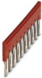
Plug-in bridge, pitch: 8.2 mm, width: 80.3 mm, number of positions: 10, color: red

Please be informed that the data shown in this PDF Document is generated from our Online Catalog. Please find the complete data in the user's documentation. Our General Terms of Use for Downloads are valid ( http://phoenixcontact.com/download )